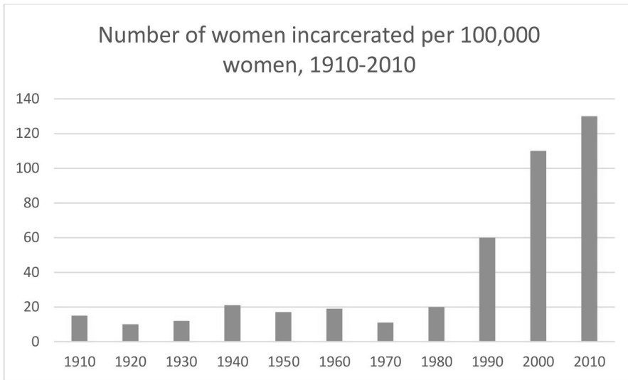
Figure 2. Women's Incarceration Rate in the United States 224

The massive increase in the number of incarcerated women in the United States imposes an enormous tax on society's welfare. Incarceration serves no substantial deterrence function in these cases because the women are often punished for being involved with men who violated the law. The great majority (over 60 percent) of them are incarcerated for nonviolent crimes, 225 and of the women convicted of violent crimes, the vast majority are for simple assaults, mostly against other women with whom they have had some prior relationship. 226 Mass imprisonment of women is especially harmful to society because the incarcerated women are prevented not only from working in the formal job sector, as is true of incarcerated