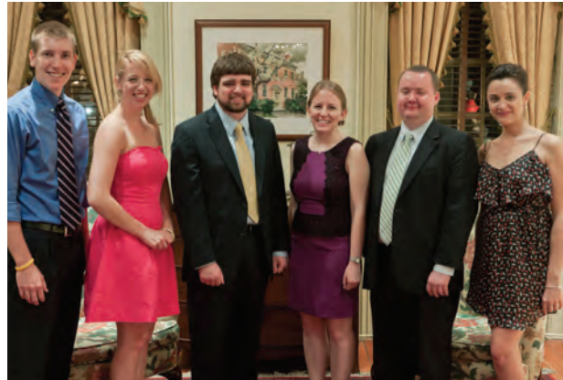
Volume 53 Notes Selection Committee