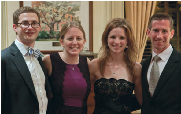
Members of The Volume 53 Executive Board