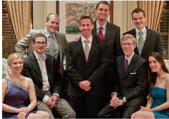
The Volume 53 Articles Committee.